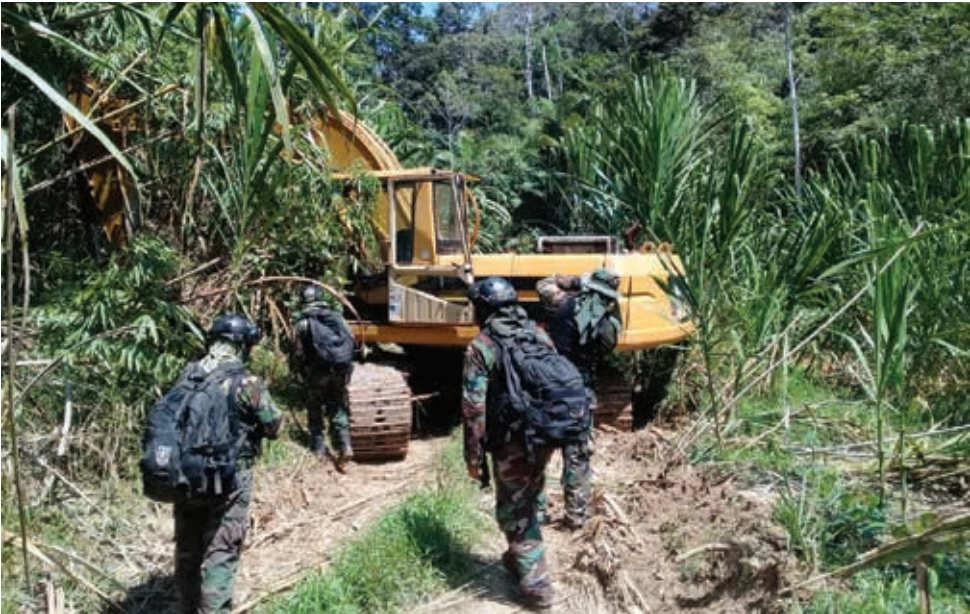
Peruvian law enforcement intervention in Boca Pariamanu, Madre de Dios, initiated by ForestLink alerts via partner FENAMAD, to tackle the devastation from illegal mining.